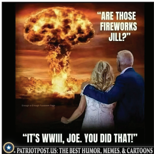
PATRIOTPOST.US: THE BEST HUMOR, MEMES, & CARTOONS