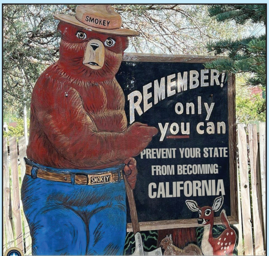
PATRIOTPOST.US: THE BEST HUMOR, MEMES, & CARTOONS